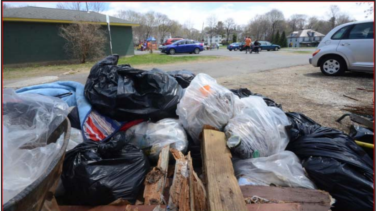
Some of the trash picked up by volunteers during the Friends of Springside Park's 27th annual Spring Cleanup for Earth Day on Saturday April 23, 2016.