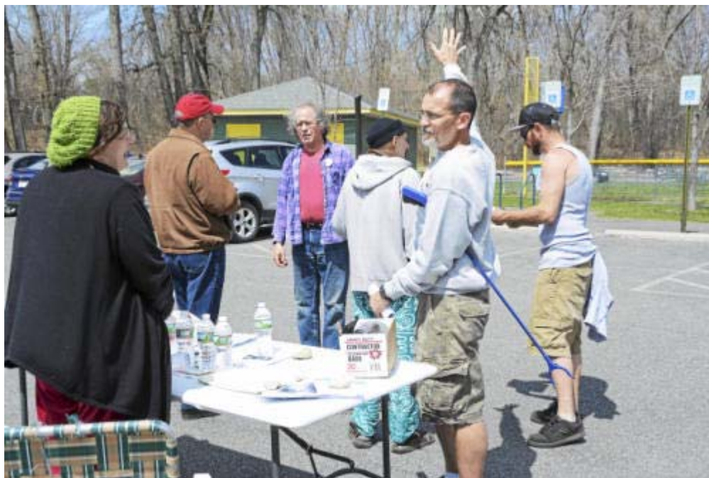
Volunteers check in and out Saturday during the Friends of Springside Park's 27th annual Spring Cleanup for Earth Day.